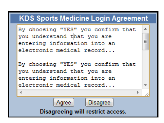
* Used for the ATS Kiosk and ATS Athlete Portal

All "athletes" will see the screen shown below with the legal statement. They must click "Agree" to get into your ATS System. A similar screen is used for the ATS Web Portal.